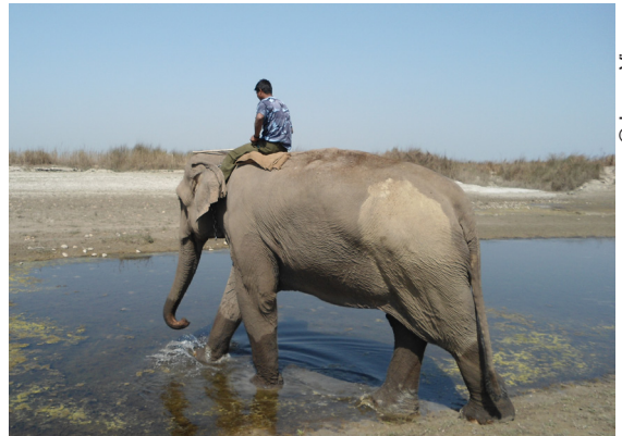
A mahout rides his domesticated elephant across the Karnali floodplain in Bardia National Park, the most effective form of patrolling.

Through cooperative effort, 55 rhino poachers and traders were arrested in 2010/11 in and around Chitwan NP (unpublished statistics, Chitwan NP). In October 2012, officials arrested an entire chain of rhino criminals in quick succession: the gang of poachers and two traders. The poaching gang consisted of 17 people, all arrested in the Chitwan area, including two women in the gang, being less likely suspects. The gang possessed NPR 900,000 (USD 10,345) in cash.