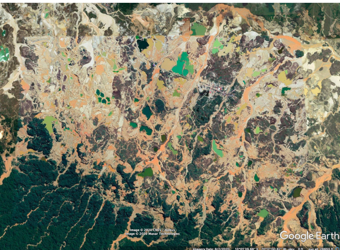
August 2020, satellite image of damage from AGSM in Madre de Dios.

mercury contamination, alteration of river channels, loss of 25 percent of wetlands, and deforestation of nearly 100,000 hectares since 1981 (Caballero et al. 2018). According to the Center for Amazonian Scientific Innovation (CIN CIA) and the Amazon Basin Conservation Association, 2017–2018 had the highest two-year deforestation total on record at 45,565 acres (Finer and Mamani 2018). With a loss of 4,164 acres from 2017–2018, ASGM activity has most altered the La Pampa area located in the buffer zone of Tambopata National