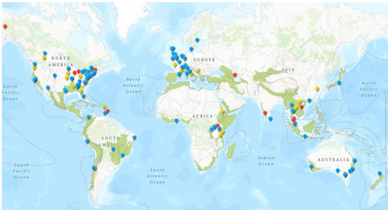
FIGURE 1 | Distribution of institutions teaching biodiversity and health interlinkages (blue icons, n = 88 ). Yellow icons represent those with indirect offerings ( n = 28 ); red icons, unclear offerings ( n = 18 ). Distribution is overlaid on biodiversity hotspots (22).

found through previous publications ( n = 96 ), international platforms ( n = 213 ), Google and MOOC platform searches ( n = 13 ), and expert consultations ( n = 19 ).