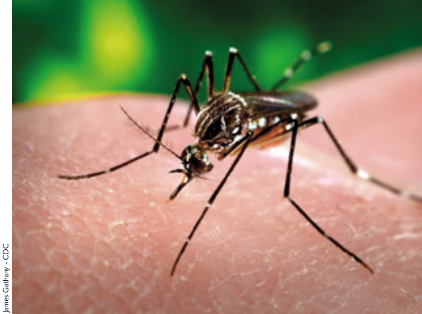
There is a growing concern among scientists about exponential increases in mosquito-borne viruses and infectious diseases being spread by animals today as the Earth warms.

Zoonotic diseases are often exchanged among agricultural workers and animals and may then spread broadly. Salmonella transmitted via