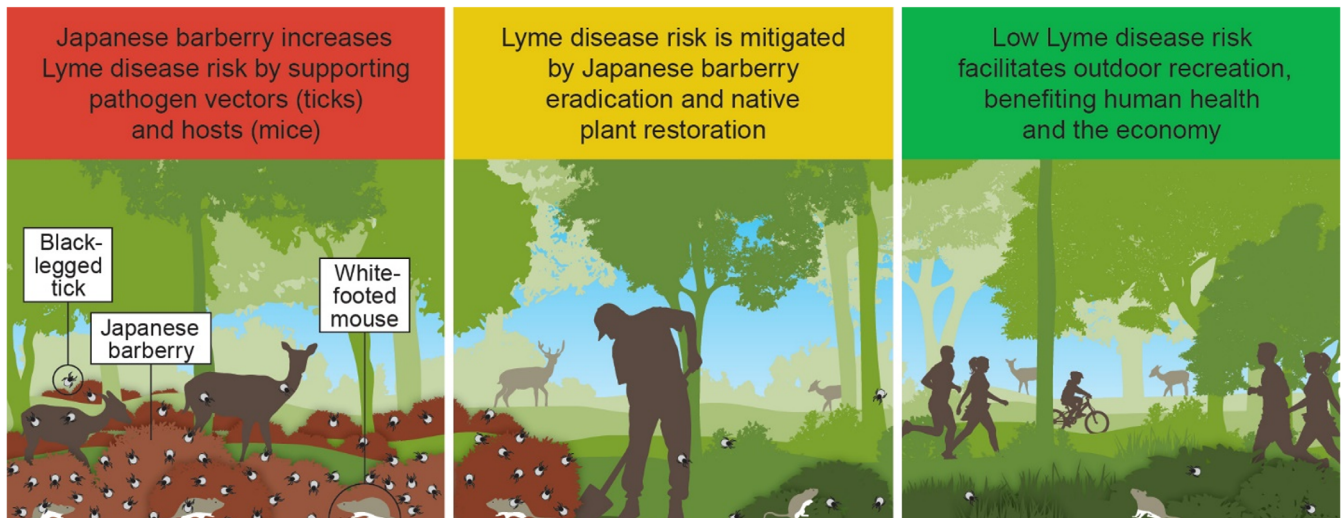
Figure 1. Ecological countermeasure for Lyme disease.

Countermeasures are generally regarded as actions taken to counteract a threat (Dictionary.com). In the military context, countermeasures involve the employment of devices and/or techniques to impair the operational effectiveness of enemy activity (DOD 2020). Medical countermeasures constitute life-saving medicines and medical supplies used to diagnose, prevent, or treat conditions associated with chemical, biological, radiological, or nuclear (CBRN) threats, emerging infectious diseases, or natural disasters ( https://www.cdc.gov/cpr/readiness/mcm.html ). From an environmental perspective, countermeasures typically refer to site remediation and restoration activities undertaken to address contaminants (e.g. Fesenko & Howard 2012; Shuangchen et al. 2017).