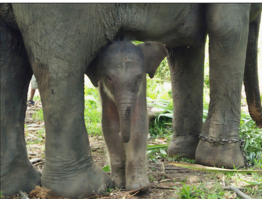
Photo caption: (from top to bottom) 1. Conducting elephant patrols. 2. Sumatran Elephant distribution in Leuser Landscape 3. Newborn Sumatran Elephant - Intan Setia Lestari.

“Using elephant patrols, we can also show the villagers that elephants can be useful in patrol. We also educate people to send wild elephants away without hurting them. So far villagers learn the techniques pretty quickly,” Pak Rusdi, Manager of CRU Trumon