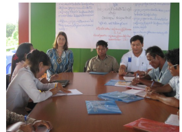
G-FISH team is meeting with Communities leaders and Commune in chief in Chong Khneas commune .

“To destroy flooded forests destroys a fish’s Home”