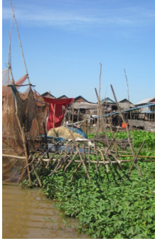
Floating village in Kampong Pluk Commune.

“Flooded forests are a valuable natural resource.”