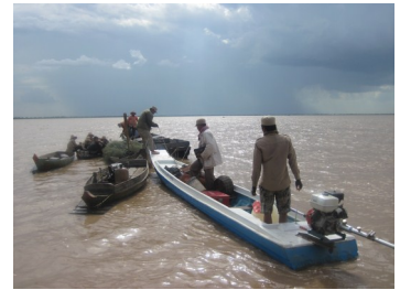
FiA cracked down illegal fishing in Tonle Sap Lake.