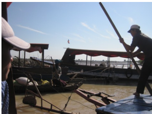
Exposure visited to Kampong Pluk Commune.

“Flooded forests are a valuable natural resource.”