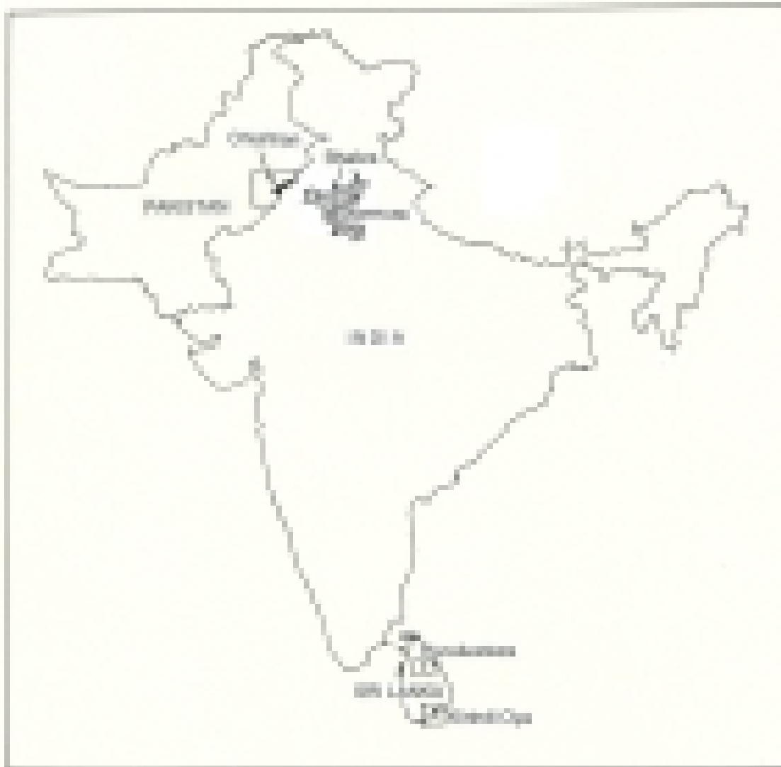
FIGURE 1. Locations of the four case-study sites in South Asia.

natural recapture zone since outflows from irrigation naturally reenter the river system and are available for reuse downstream. The Kirindi Oya subbasin contains a regulated recapture zone,