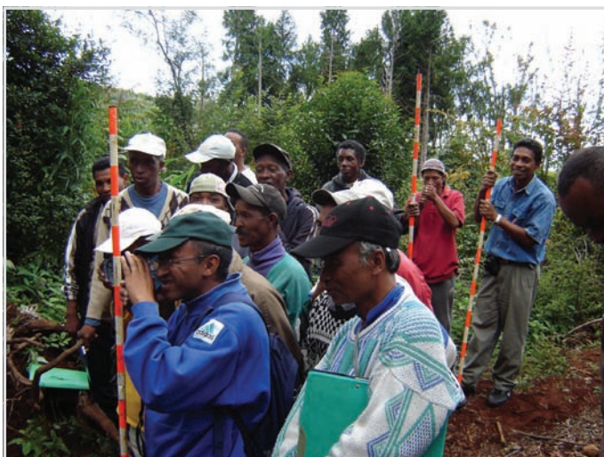
Capacity building of national environmental management structures has been a pillar of USAID's program in Madagascar since EP I. In this picture, foresters practice techniques necessary for forest zoning.

Under EP I, U.S. institutional efforts were focused on creating ONE and ANGAP, while the World Bank put resources into DEF capacity building through the Forest Management Project. 44 The Debt-for-Nature project did train a cadre of some 400 nature protection agents at the local level. These people, recruited primarily from the rural areas where they lived, did not have enforcement power. Instead, they acted as liaisons with the forestry service for environmental education and "dissuasion" of illegal activities. Debt for Nature also helped to construct some DEF offices, provide uniforms, and otherwise increase the professionalism of the forest service.