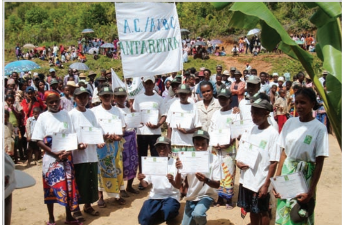
The Commune Mendrika (Progressive Communes) program rewarded communities that made significant progress toward environment, health, governance, and economic goals.

skills to manage their internal affairs, raise and properly use tax funds, and lobby government authorities to address critical problems (e.g., road washouts). This was beginning to have some positive results. The EP III “Commune Mendrika” program focused on commune level planning and interventions, with rewards for good governance and other achievements. MISONGA began to get promising results with its mentoring program for female commune mayors.