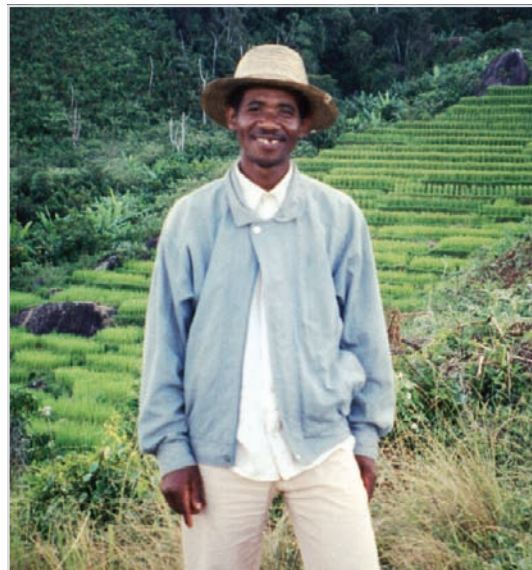
Intensifying rice production (here a farmer in the Ranomafana corridor has adopted some of the SRI recommendations) can help to reduce pressures on the forest but increased revenues can also give farmers the means to hire labor to make additional tavy fields.

Alternatives to tavy. Numerous technical approaches were essayed with varying degrees of success. In EP I much attention was focused on the valley rice-growing areas where it was thought that substantial increases in yields could significantly reduce farmer interest in tavy . This assumption had several flaws. While there were dramatic improvements in yields (using System of Rice Intensification – SRI 79 techniques) on very small