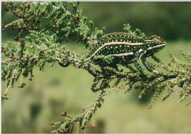
Madagascar's biodiversity is unique: 98% of its mammals, 91% of its reptiles, and 80% of its flowering plants are found nowhere else on earth.

Concerted efforts 2 to save Madagascar's natural forests 3 began in the mid 1980s when Madagascar and its partners began preparing the first Madagascar National Environmental Action Plan (NEAP).