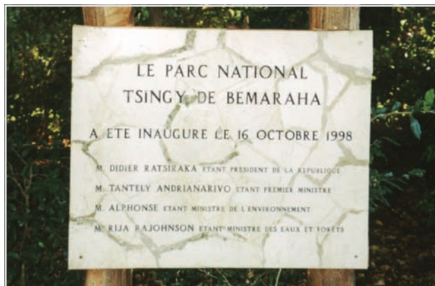
Madagascar has made enormous progress in establishing and funding its national parks since the NEAP was launched. In 2003, President Ravalomanana committed to putting 10% of the country's land under protected area status.

All of these spatial analyses were (unbeknownst to some of the participants) leading up to Durban 2003. In the months leading up to the IUCN Worlds Parks Conference, the conservation triumvirate worked with President Ravalomanana and the DEF Director to prepare Madagascar’s commitment to allocate 10% of its territory to protected areas status. This would put Madagascar in compliance with the IUCN global goal established in Brazil a decade earlier. When President Ravalomanana