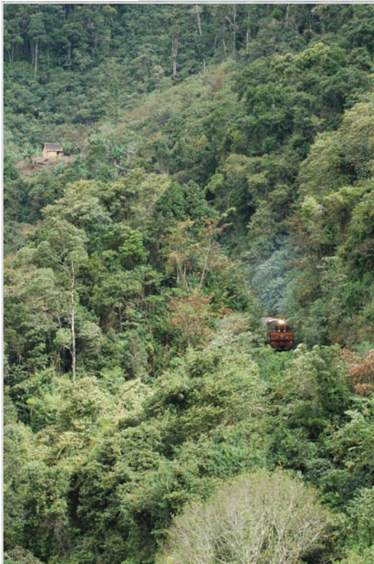
Saving the Fianarantsoa forest corridor depends in large measure on saving this train line that traverses the corridor. The FCE railway debacle sadly illustrates how bad governance can sabotage economic and environmental progress.

The issues raised here are by no means unique to Madagascar; though Madagascar's governance problems are profound and persistent. The fact that other countries face similar issues is not much consolation, however; unless we can show that those countries have made rapid and significant progress on economic and environment indicators in spite of governance weakness. In Madagascar, we are left with the question of whether progress on environmental issues can take place in the context of a State which may not want to be reformed and may not have a true commitment to sustainably managing its environment. At a minimum that conclusion would beg a change in the "benign state" approach employed by donors over the past quarter century.