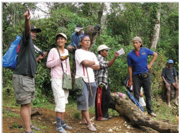
In this photo, COBA members monitor tavy activity at the forest edge. Enforcement of illicit activities within villages has proven difficult due to the need to maintain good social relations. The state rarely backs up COBA enforcement efforts.

The costs of management. Comparison of the costs of enforcing forest policies through DEF or through COBA mechanisms confirm that it is much less expensive to work through the COBAs. One recent set of estimates posited that it costs the COBAs about $.08 to control a hectare of territory as opposed to ANGAP's local cost of about $5-$8 per hectare to manage a small park (Hockley, 41). These co-management costs underestimate the other inputs needed to make this system sustainable and effective (notably the need to provide some external enforcement and the vulnerability of the co-management system when benefits are not sufficient to maintain community interest), but they are nonetheless telling. Given this advantage,