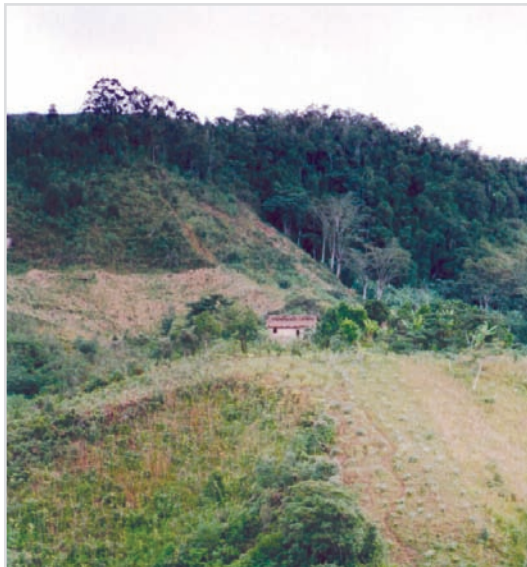
Tavy remains the principal cause of humid forest destruction as forest reserves are transferred into agricultural production zones; this photo from Ambodigavy in the Zahamena forest corridor c. 1998.

As the primary proximate cause of forest conversion in many of the priority biodiversity zones (nationwide estimates suggest that 80-95% of deforestation is caused by agricultural conversion, while the remainder is caused by extraction of wood for fuel or building materials), the PE II and PE III eco-regional projects put enormous effort into persuading farmers to forego the extensive slash-and-burn agricultural production system. 74 While these production systems were sustainable in the past, when the population was small, fertile land was abundant, and 15-year fallows allowed soil fertility to regenerate before land was put back into production, these conditions no longer exist in Madagascar. With fallows that rarely exceed three years, there is rapid deterioration of soil fertility and many lands are more or less abandoned for agriculture after 20-30 years (which equates with fewer than 10 harvests).