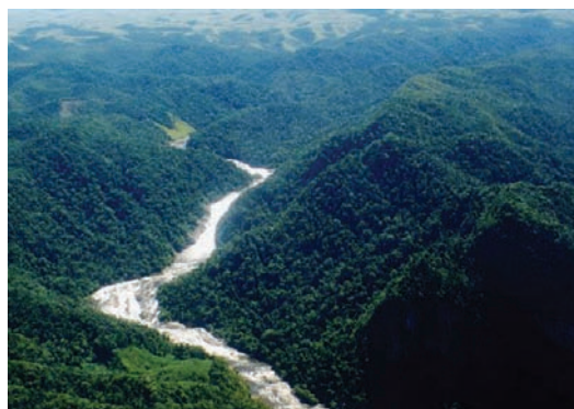
From EP I to EP II, the emphasis shifted from the integrated conservation and development (ICDP) approach to protecting much vaster corridors linking national parks. (Here: the corridor between Ranomafana and Andringitra parks.)

To get from the general principles of the NEAP to operational programs, in 1988 the World Bank formed a series of working groups that mobilized about 150 Malagasy from government, academia, and civil society alongside about 40 international environment experts (many of whom are still involved today). The working group proposals were then approved by the National Assembly. The grand plan for implementing the NEAP was divided into three successive Environmental Programs: