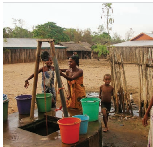
This Menabe photo shows the well built with PES funds in Tsitakabasia in return for villager protection of forest resources.

Avoided deforestation. In general, the focus in Madagascar has been on avoiding deforestation (keeping existing forests intact), rather than reforestation or afforestation (although CI is currently doing some reforestation of forest corridors in Zahamena), largely because the fundamental environmental concern is biodiversity, rather than merely “greening” the country. This has complicated PES implementation because avoiding deforestation was not, in