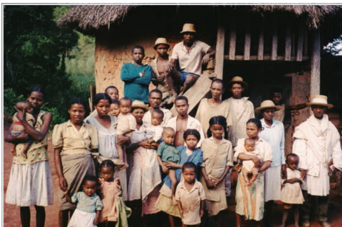
Many of Madagascar’s rural people, as this family who farms next to Andringitra Park, depend on natural resources for their livelihoods. Difficult as it may be, it is imperative that future interventions do even better at incorporating local voices and social justice issues into our treatment of biodiversity issues in Madagascar.

All actors in the next phase of environmental planning should incorporate significant changes in the international context into their analyses. If Madagascar’s environmental profile has risen over the past 25 years, so has interest in its mineral and petroleum riches. Influencing these giant national and multinational industries will require different strategies from those employed in previous environmental programs.