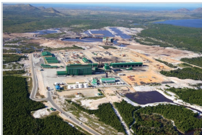
The arrival of multinational mining companies (here a photo of Rio Tinto's operations near Fort Dauphin) adds new challenges to environmental conservation in Madagascar.

Concern about the effects of climate change on Madagascar's biodiversity and livelihoods motivated the organization of the 2008 Climate Change workshop in Antananarivo. USAID and its partners (among them CI and WWF) played a key role in helping the GoM to organize the workshop with MacArthur Foundation support. The U.S. Ambassador was a keynote speaker. More than 130 experts participated, some bringing experiences from Madagascar; while others used sophisticated models to predict the likely effects of climate change on different species and eco-systems.