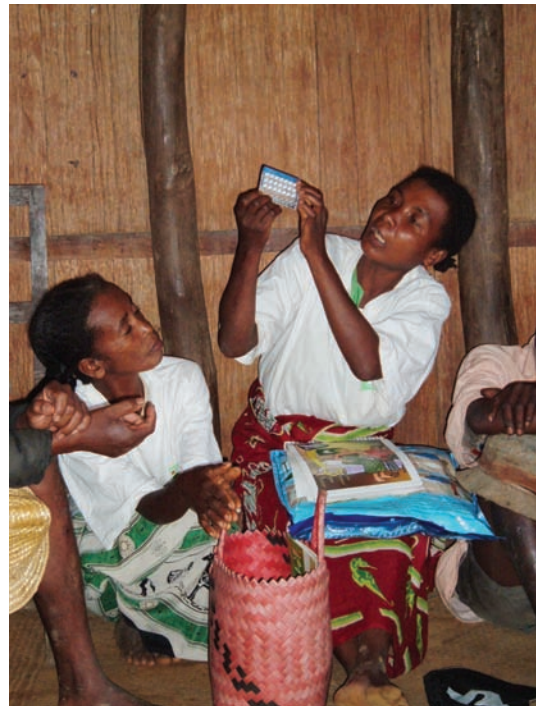
The integration of health, family planning, and environmental programs in priority conservation areas has been an important feature of USAID’s Madagascar program. In this photo, a family planning demonstration in Tsaratanana, in the Ranomafana-Andringitra corridor.

Partly as a result of working together in this remote and challenging context, the vision became more sophisticated. Initially, collaboration grew out of a perceived need to slow population growth that was undermining the ability of environment/rural development projects to achieve per capita improvements (e.g., in rice production) as needed to reduce pressures on natural resources. As such, the early focus was on getting contraceptives into areas around the Protected Area (PAs) and corridors. By the late 1990s, there was growing recognition that health interventions could play a more significant role in promoting conservation activities. Specifically, it became clear that doing