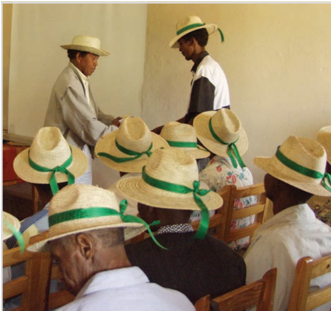
The KoloHarena Farmers movement has been one of the most successful civil society interventions implemented under USAID projects. As the association has grown and matured, however, some of the environmental focus has dissipated. Here community extension agents receive certificates honoring their work.

It is interesting that the civil society movement that may be the most well established among those mentored under USAID projects is the KoloHarena farmers movement. 118 Initially, the KoloHarena associations had a strong environmental focus. The target population was the farmers living immediately adjacent to the USAID priority forest corridors. In return for agreeing to forego tavy , farmers who joined the association were eligible for credit and other project assistance to help them undertake alternative agricultural and livelihood ventures. The movement has gained strength over the years as it has responded to the practical needs of its members (e.g. running remote agricultural supply centers and helping farmers connect to buyers for commercial crops). KoloHarena effectiveness has been greatly enhanced by their access to the ham radio communications system that the projects installed in communities along the forest corridors.