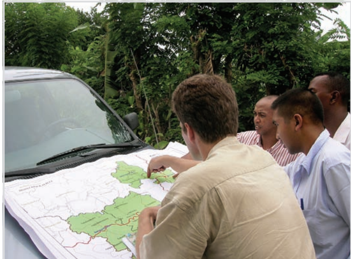
Protected areas under the new SAPM system will be zoned into various categories, approximately half of which will involve some degree of co-management with either local communities or private operators. Some KoloAla (production forest sites) will be within the protected areas, while others may be defined outside the protected area system.

For sustainable harvesting to work, it is critical that "legitimate" forest products be differentiated from those that have been harvested illegally since it is more expensive to harvest sustainably and illegal products engender unfair competition. The "chain of custody" model (a series of procedural reforms, accompanied by a new wood marking system, computer monitoring software, and training) developed by DEF and Jariala at least theoretically enables forest products to be tracked from place of origin to final use. If legally adopted and applied, this tool will be a powerful addition to the forest management arsenal.