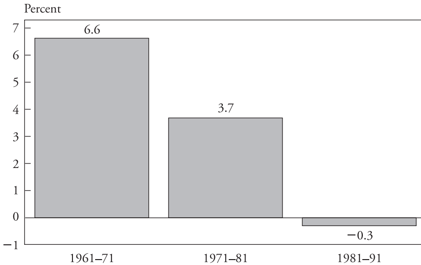
Figure 17.2 Annual Growth Rate of Expenditures in African national Agricultural Research Systems