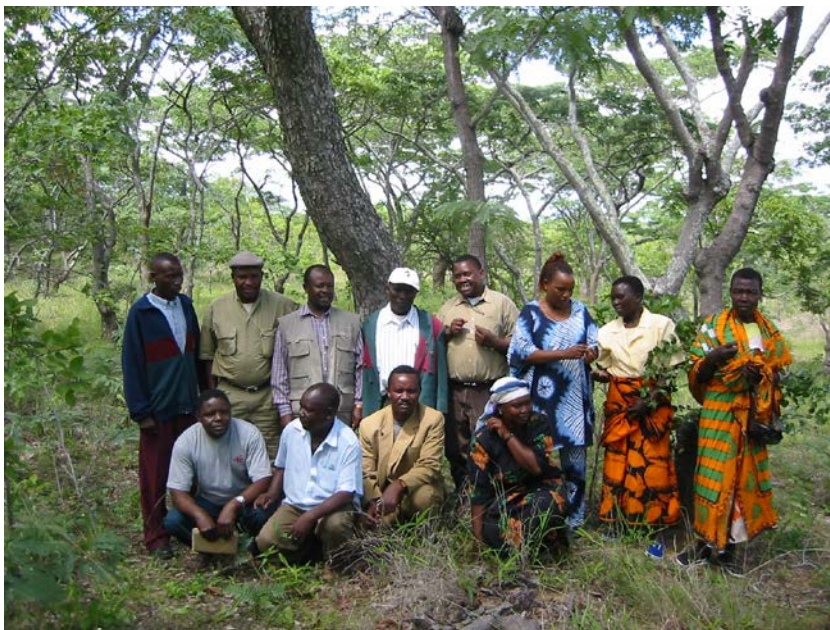
District Staff supporting community forestry in Mufindi, Tanzania.

This report is an attempt to bridge this communication gap, but much work is still needed to strengthen these links.