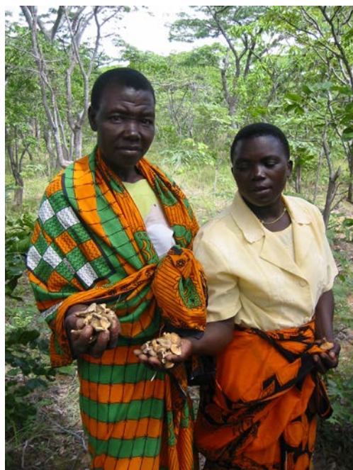
Women in Mufindi, Tanzania, with mushrooms collected from community forest.