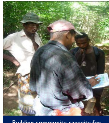
Building community capacity for forest carbon monitoring is a FCMC goal

A functional REDD+ mechanism requires national institutions capable of managing Measurement, Reporting, and Verification (MRV) systems. These apply a range of technologies, including remote sensing, forest inventories, and soil surveys, and also require the capacity to synthesize information into reliable and transparent reporting. Many developing countries with dynamic forest frontiers could benefit from REDD+ activities, but do not yet have the capacity to participate effectively in emerging international REDD+ markets, in part because of a lack of a MRV system.