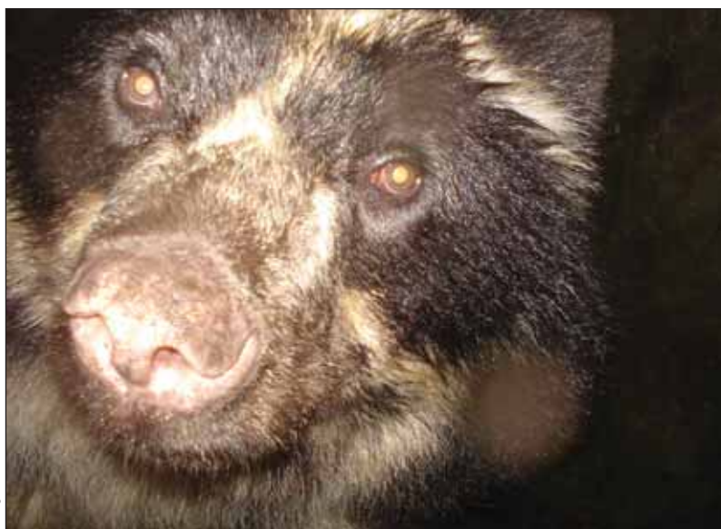
Figure 4. A wild Andean (or spectacled) bear ( Tremarctos ornatus ) photographed by a motion-activated camera on the property of All Things Alpaca Ecuador.