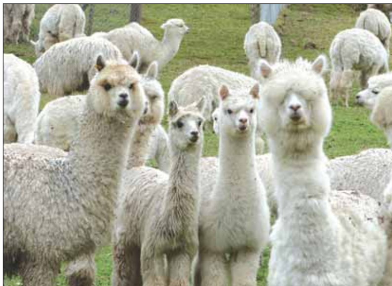
Figure 3. Domestic alpaca from All Things Alpaca Ecuador – a Certified Wildlife-Friendly business.

mium pricing to offset the costs of field verification. A number of industry-specific and local variables will determine the precise shape of the curvilinear relationships and the optimal point for verification effort; for example, new monitoring or production technologies (Figure 4) may enhance consumer confidence without costing producers more.