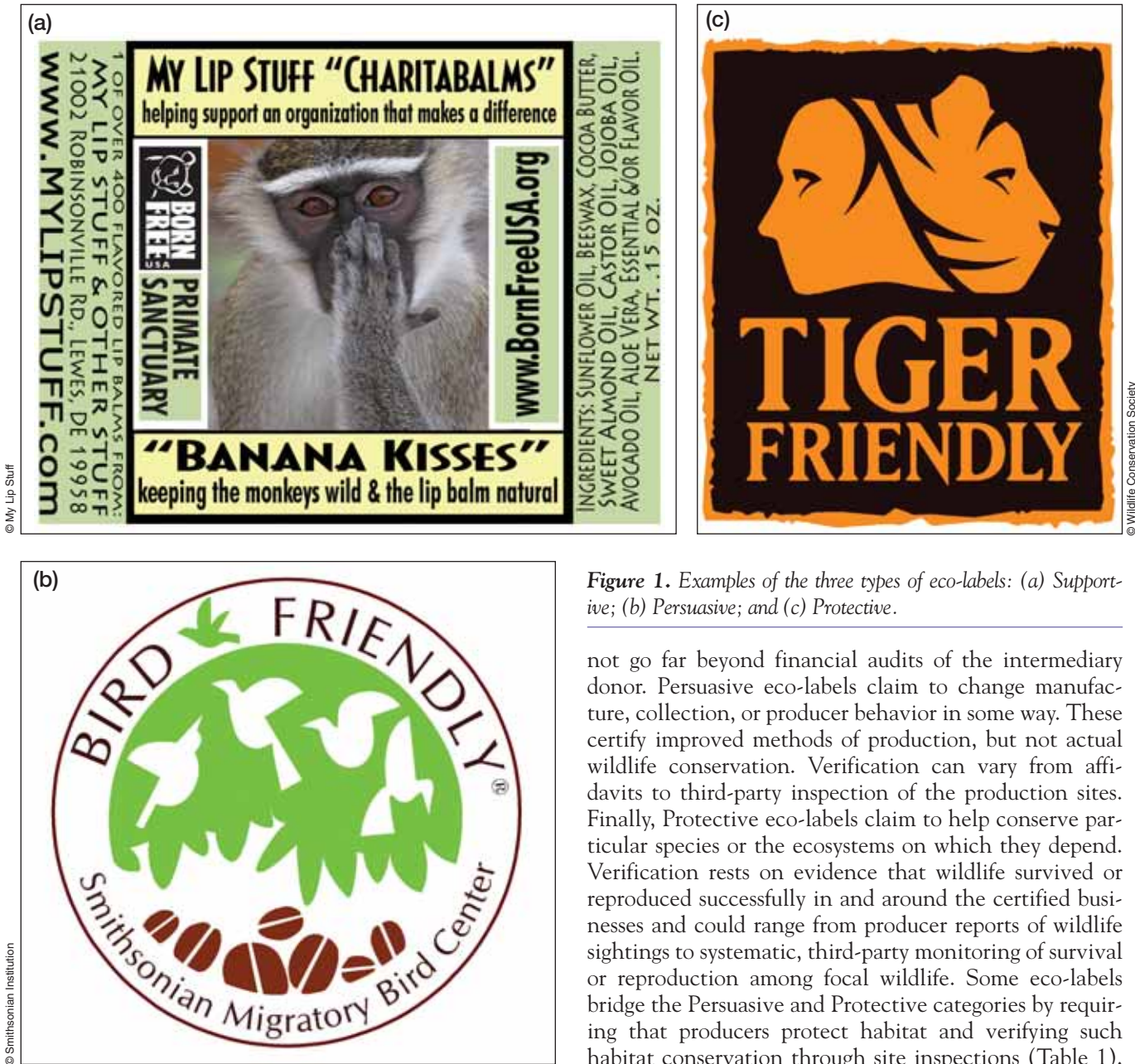
Figure 1. Examples of the three types of eco-labels: (a) Supportive; (b) Persuasive; and (c) Protective.

comparison of data collected during verification against a consistent set of pre-existing criteria (ie standards).