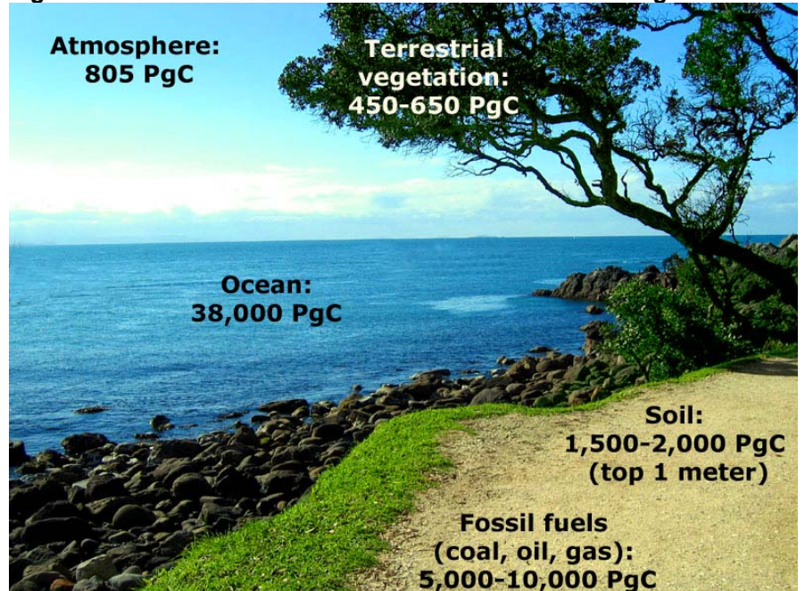
Figure 1. Estimates of total carbon stocks as of 2005 in Pg.

Figure 2 shows mean soil carbon stocks under different land uses. Forests and secondary forests have higher soil carbon stocks compared to pasture, tree plantations, cultivated land, and grassland. Generally, therefore, clearing a forest to cultivate crops will result in high emissions of carbon to the atmosphere. Indeed, one study estimates that cutting down a forest