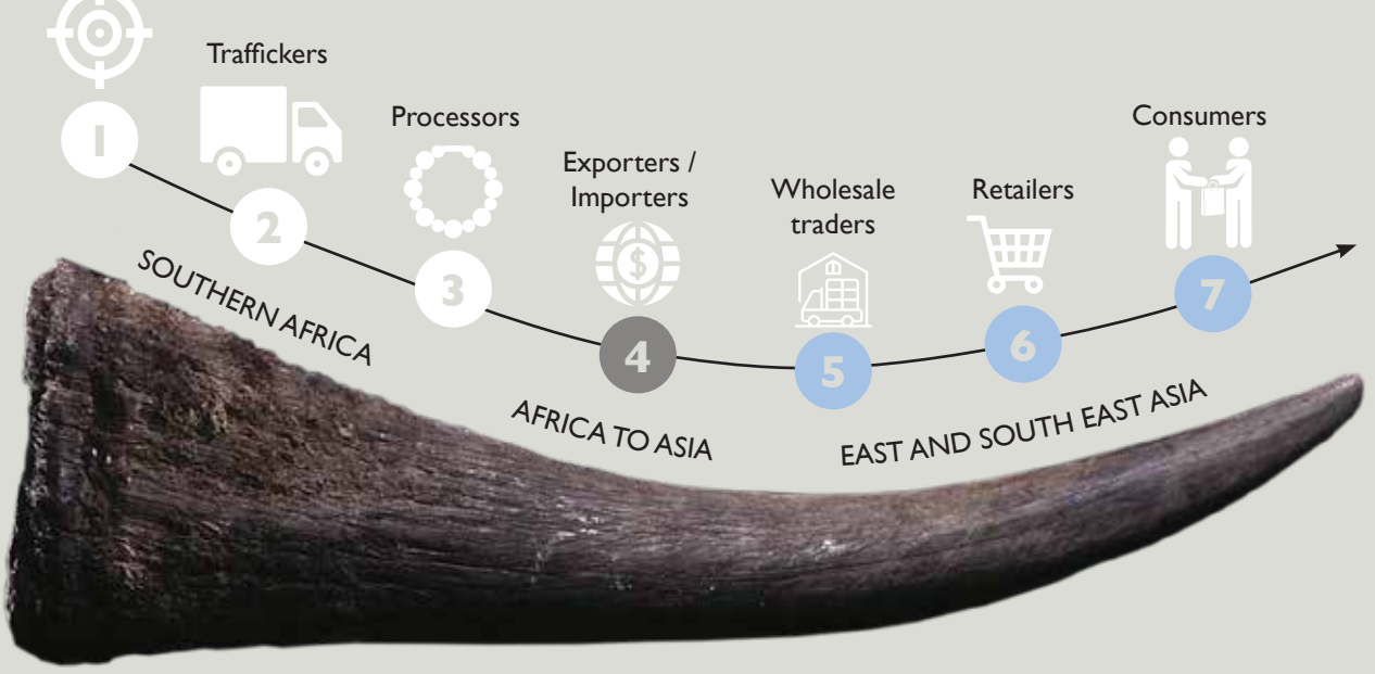
Actors along the rhino horn value chain.

**The chemical make-up of rhino horn is the same as human fingernails, so it hardly needs stating that the claims of its medicinal properties are entirely without scientific basis. **