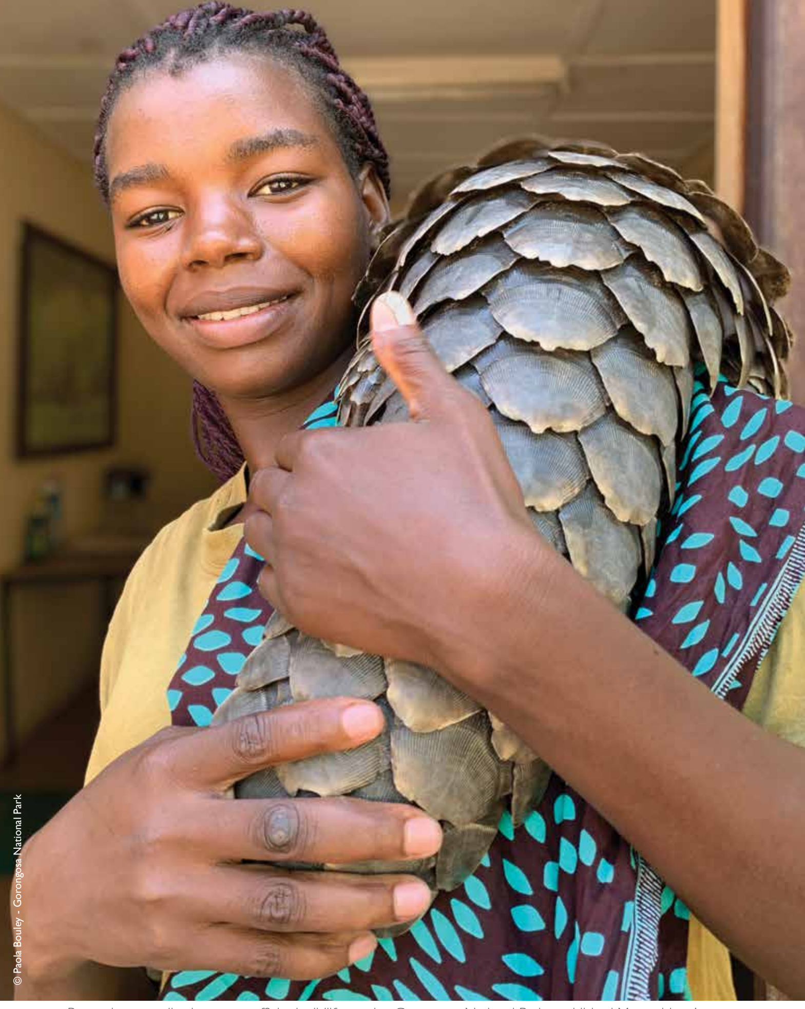
Protecting pangolin, the most trafficked wildlife species. Gorongosa National Park established Mozambique's first pangolin rescue facility.